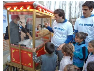
Day of the Child